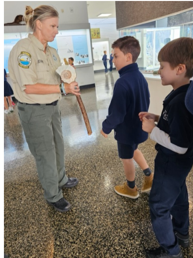
Students learn about old tools used by the Native Florida Indians. This is made from a conch shell.

When a situation arises where public schools are closed or closing for half day we follow their guidelines. Half days end at 12noon. Please be sure you have an emergency person who can always pick up your child if you are unable. We will post on Facebook and send Emails when possible as well when school is interrupted.